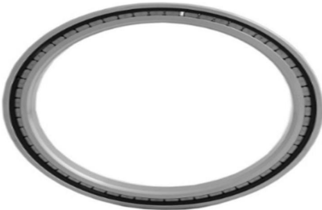
Cylindrical Roller Radial Bearings/Full Complement

These brands have garnered global customer favor with their rich experience, excellent technology, and professional services, playing an important role in the Cylindrical Roller Radial Bearings/Full Complement field. With continuous industrial technological advancement and growing market demand, these brands will continue to strive to provide more advanced and reliable products and solutions, creating greater value and success for customers.